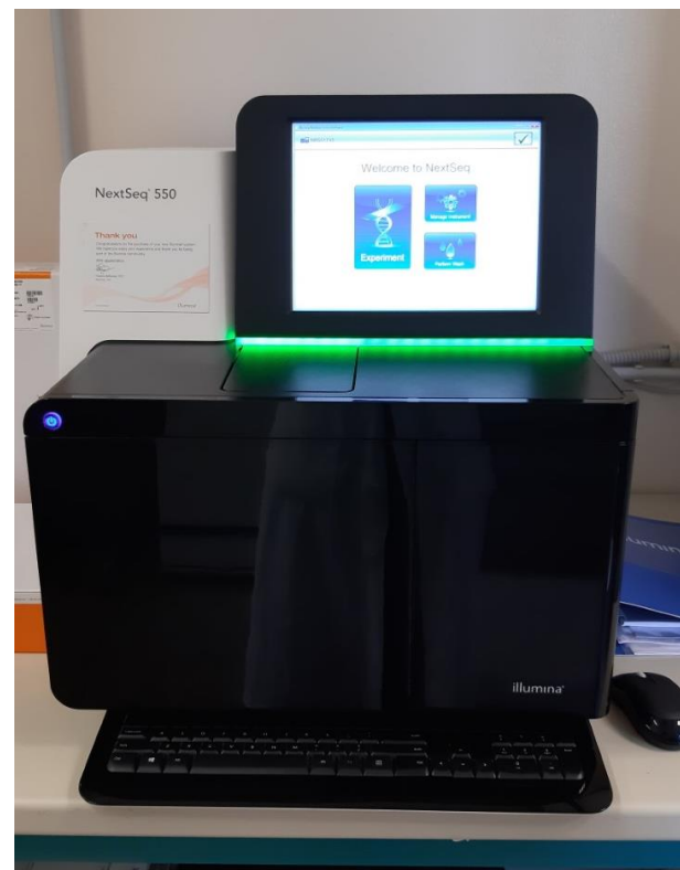
NextSeq 550, Illumina