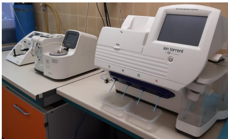
Ion Torrent PGM, Life technologies